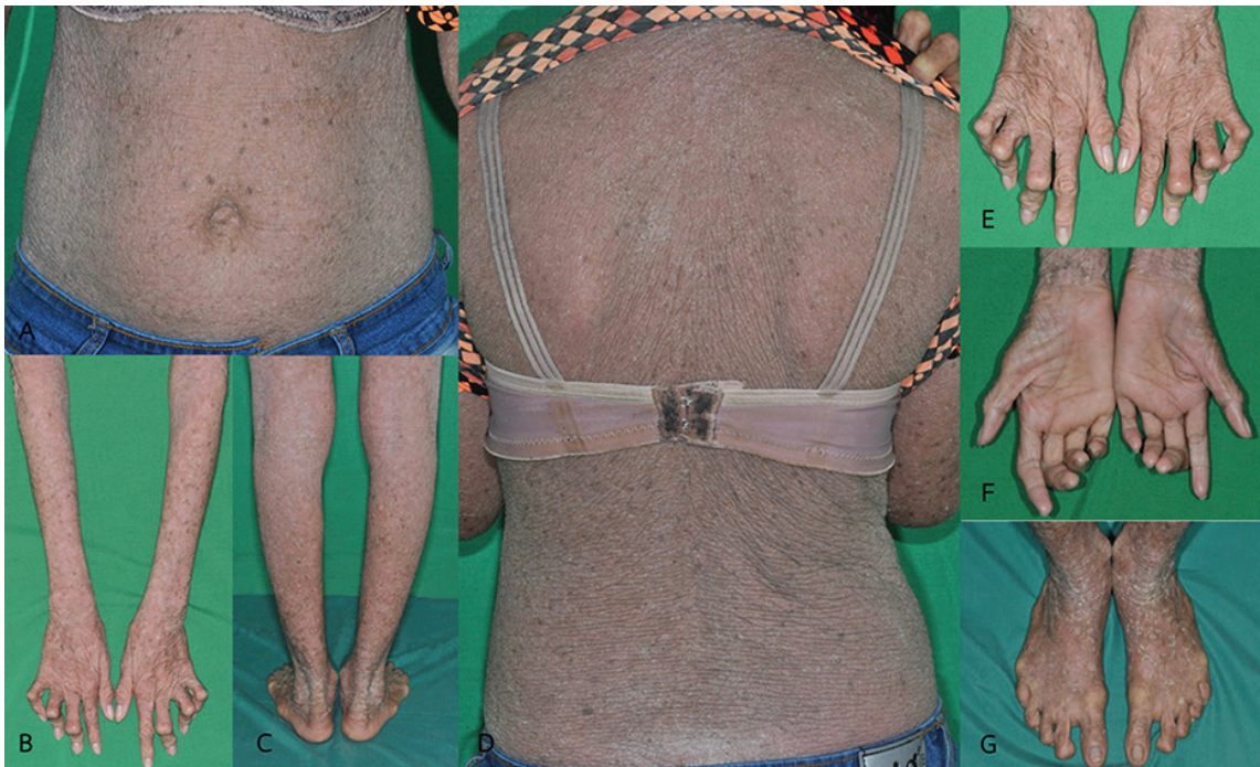
Figure 1 Epidermolytic ichthyosis. (A–D) Widespread scaly brownish hyperkeratosis and multiple lentigenes are noted. (E–G) Contraction deformity affected fingers and toes.

A 39-year-old woman presented with generalized erythroderma and desquamation since birth. Later in life, she developed generalized marked hyperkeratosis without palmoplantar keratoderma. The patient and her parents had no history of skin blistering at birth. The affected skin was thick and darkened, and accentuated creases had formed over time. She was unable to fully extend her fingers and toes. To her knowledge, she had no family history of similar skin conditions. Physical examination revealed generalized scaly hyperkeratotic plaques over the face, trunk, and extremities, with skin crease accentuation over the joints and body folds. There were no blisters, erosion, or ectropion/eclabium on the periorificial skin.